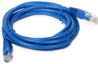
RJ-45 (Ethernet) Cable